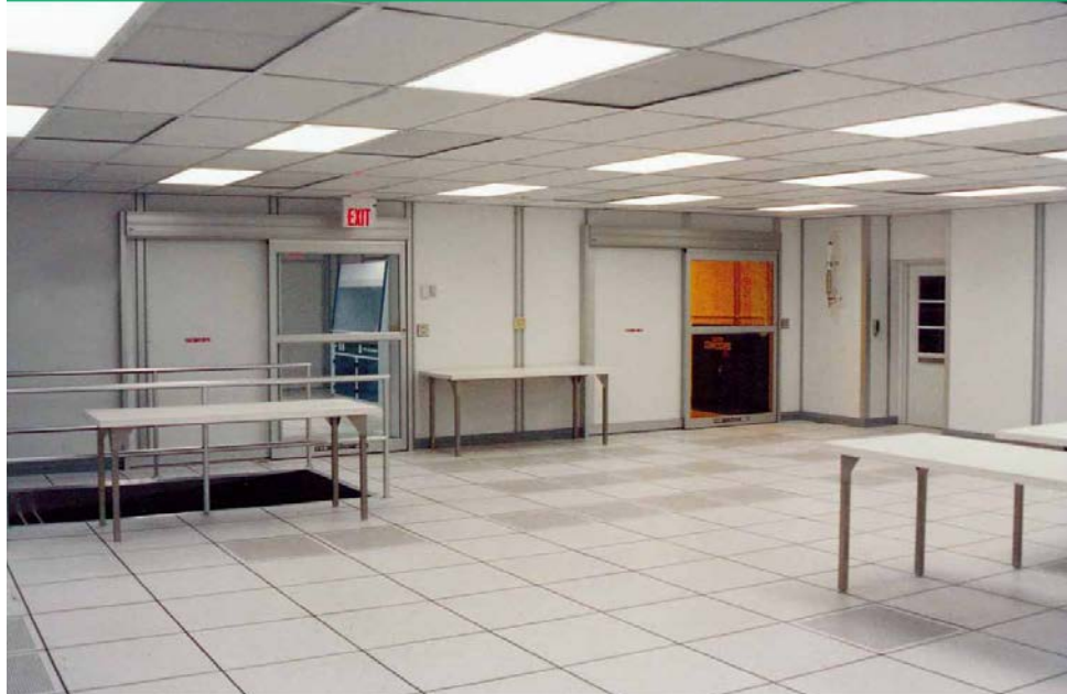
Class 100 (ISO 5) Cleanroom with Raised Floor (at rest)