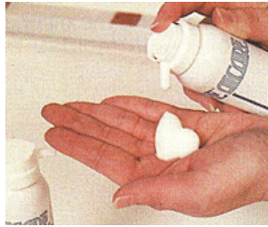
#6395-57 Alcare ® Hand Germicidal