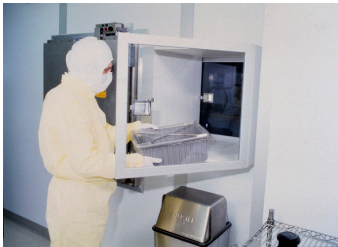
Model H100 SS Stainless Steel Pass Thru

Once in the garment room, watches, jewelry and any clothing not to be worn in the cleanroom should be stored on the "dirty" side. The personnel in special garments, then progress to the "clean" side of the room. The Tacky Mat ® should be at the entrance of the cleanroom with a waste receptacle placed near it. Due to the "dirty" to "clean" transition, the garment room is a good path to bring items into the cleanroom, either using a pass thru, Liberty's H100SS or H100PL series , or by carrying them in.